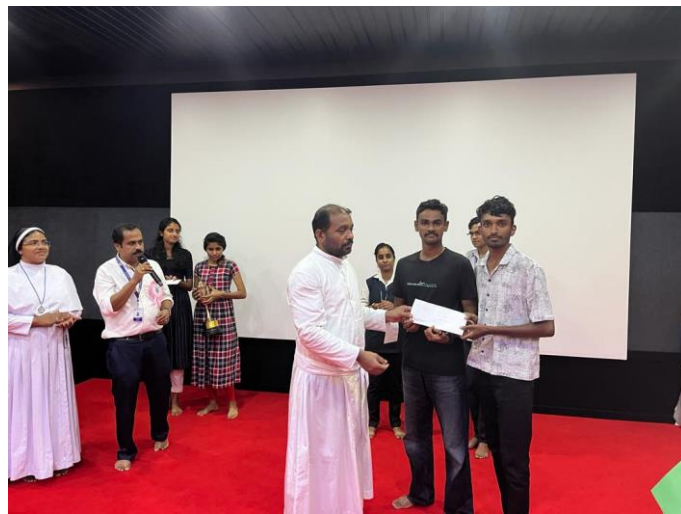
First, second and third prize winners receiving certificates and cash prizes from the college Principal