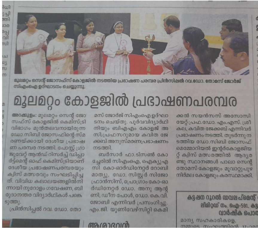
Newspaper cutting of the programme