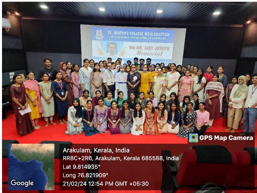
All the participants of National Seminar with the two speakers