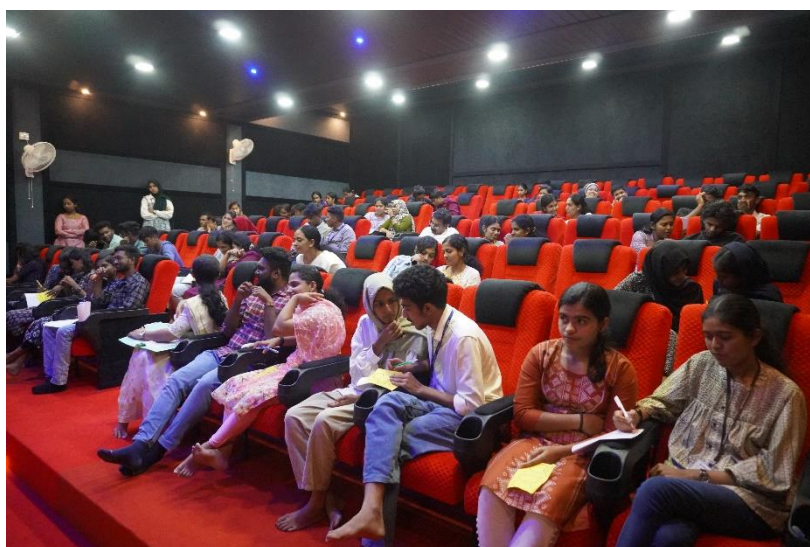
Students participating in the Quiz contest