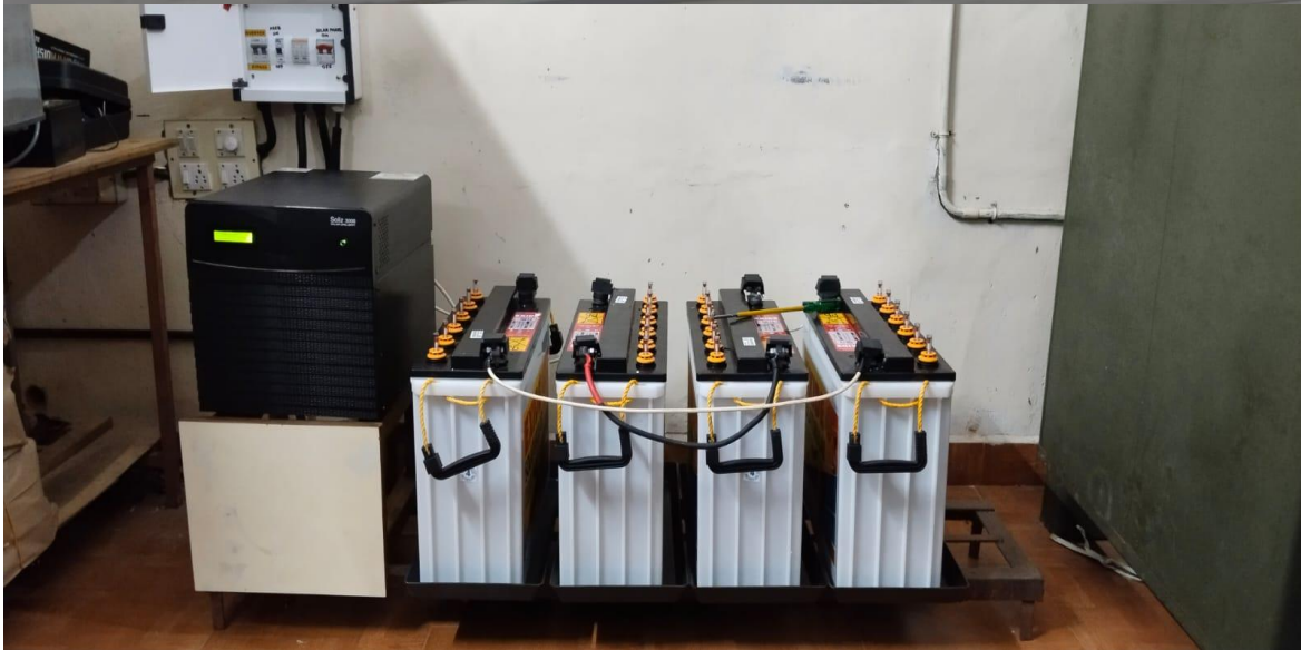
SOLAR ENERGY UNIT