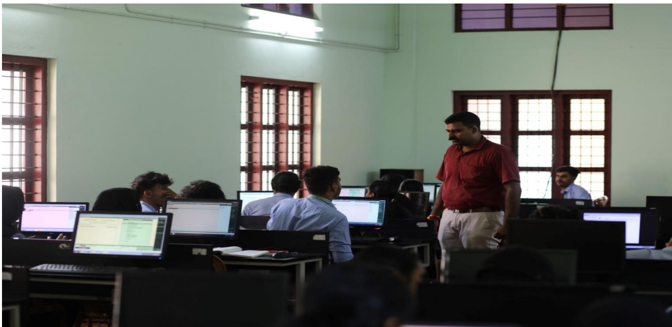
RENOVATED COMPUTER LAB

ARAKULAM P.O- 685591 IDUKKI, KERALA stjosephscollegemoolamattom.ac.in