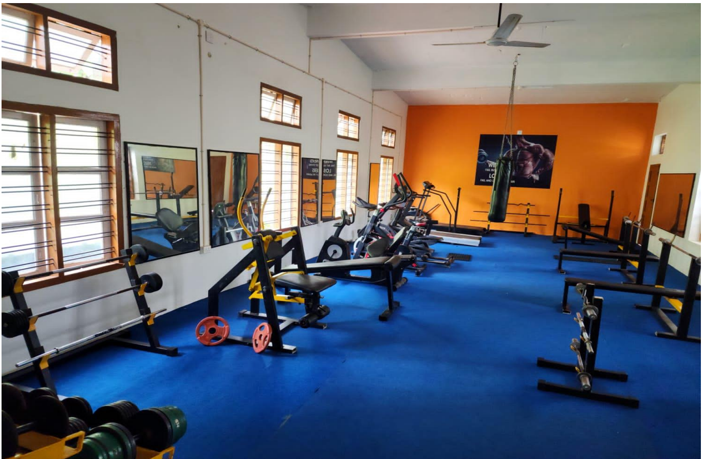
NEW MULTY GYM