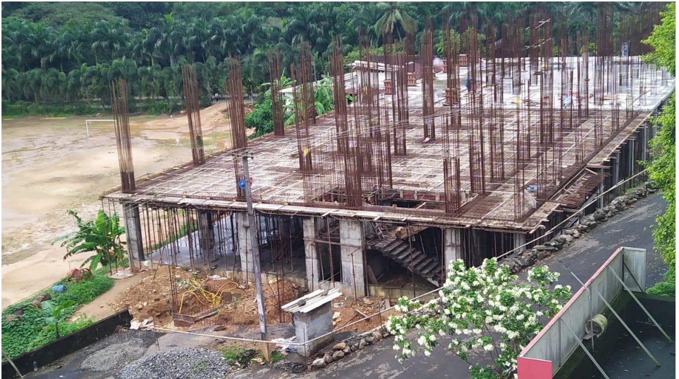
NEW ADMINISTRATIVE BLOCK UNDER CONSTRUCTION