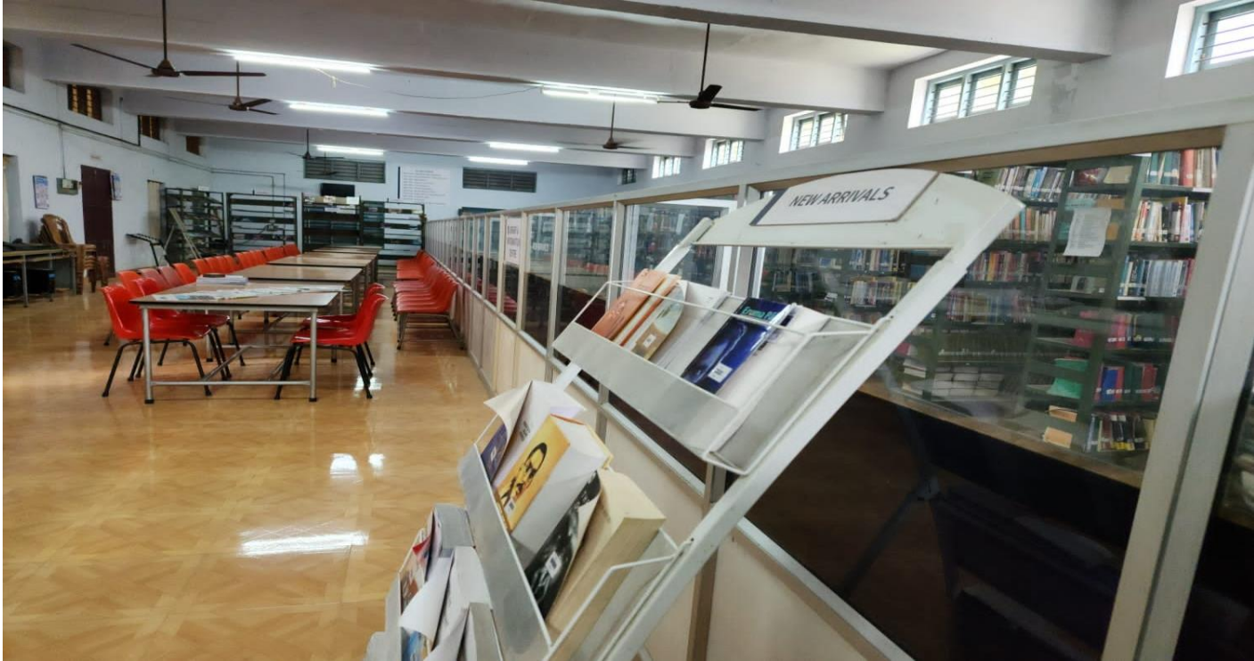
RENOVATED COLLEGE LIBRARY

ARAKULAM P.O- 685591 IDUKKI, KERALA stjosephscollegemoolamattom.ac.in