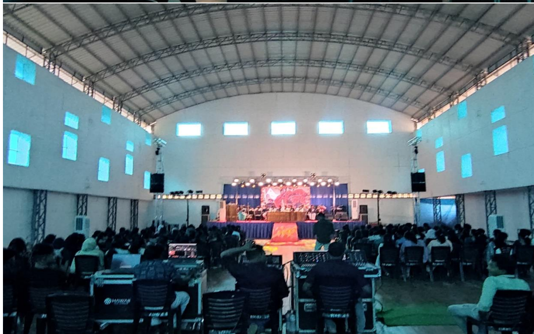
NEW INDOOR STADIUM