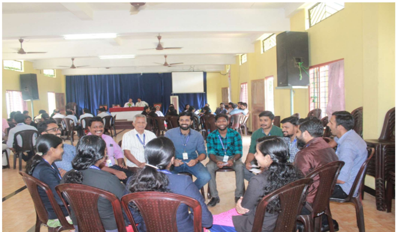
Staff members attend the Staff Orientation programme