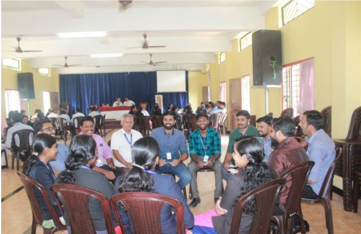
Staff members attend the Staff Orientation programme