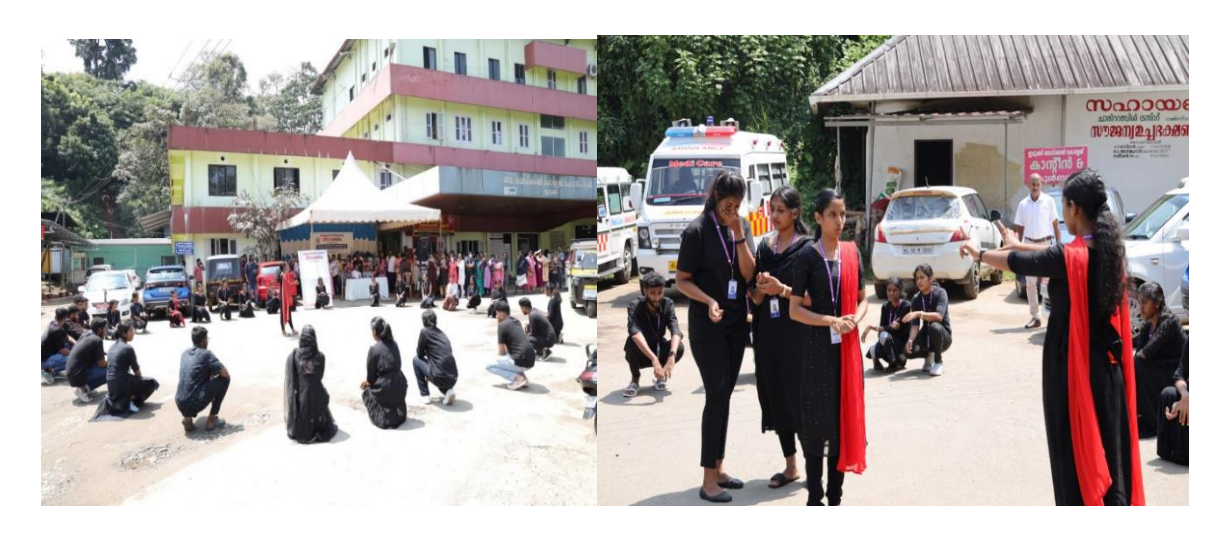
Street play by MSW students at Cheruthoni town in Idukki District