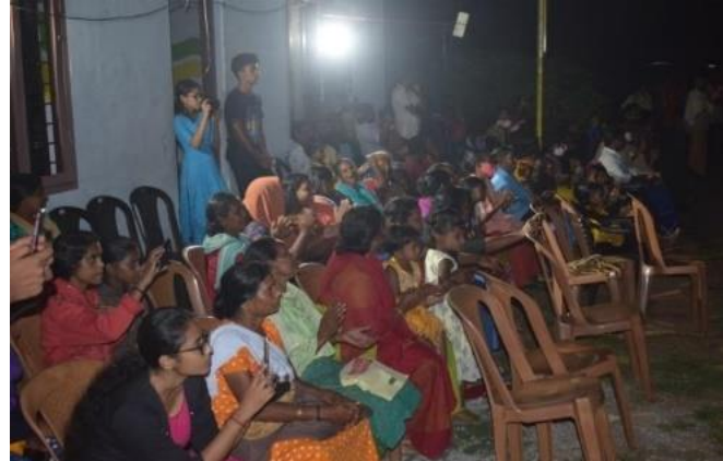
Students performing a street play at Chinnapprakkudi, a tribal settlement

As part of our community integration programme, the social work team in association with Green Valley Development Association conducted a grant cultural event at Narakakkanam (Parish Hall). About 100 SHG members were present. Different sorts of cultural activities including dance, songs, mono-act and streetplay were performed during the cultural eve.