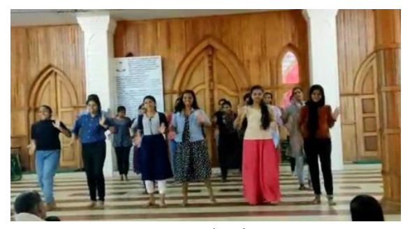
Street play in progress

A street play and flash mob event were organized by the MSW Department of St. Joseph's College, Moolamattom on October 10<sup>th</sup>, 2023 (World Mental Health Day) served as a testament to the potential of education and creativity in promoting social awareness and community engagement. The impact extended from the medical college to Cheruthoni town, underscoring the lasting influence of these events on the local community. This event not only entertained but also educated, inspiring conversations and actions that can lead to positive social change. TSW circulated leaflets to the general public of Cheruthoni town about mental health awareness. It exemplified the college's commitment to producing responsible and socially conscious citizens who are ready to make a difference in society.