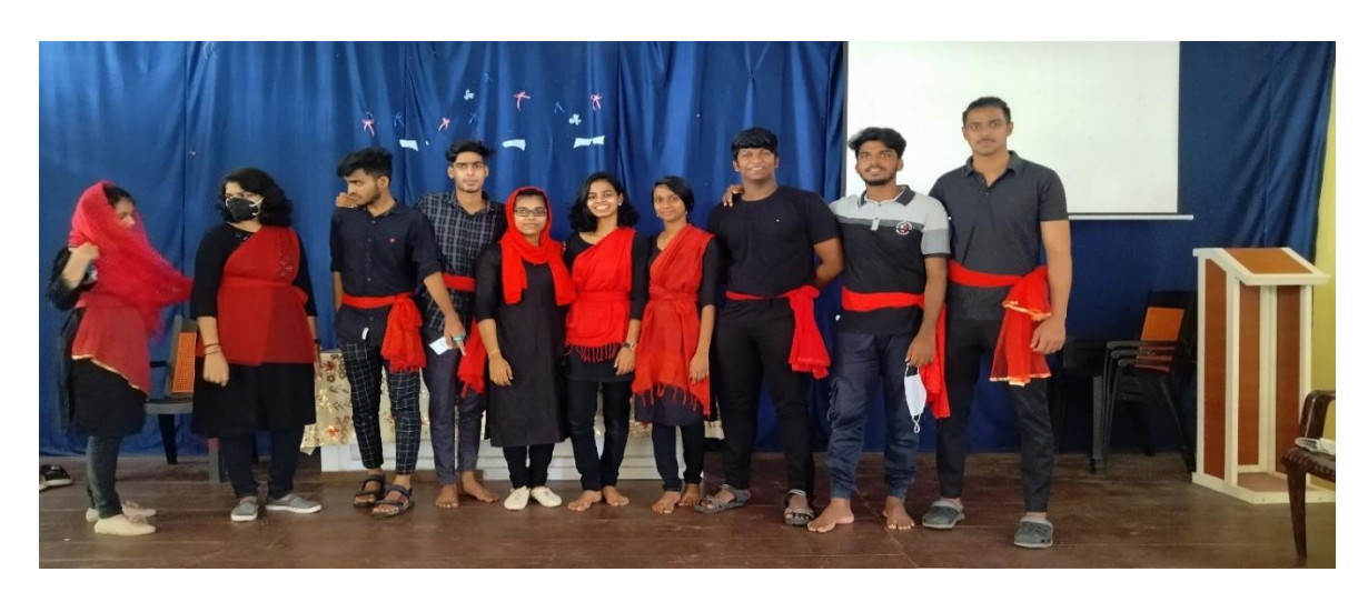
The street play team