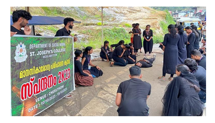
Students perming in the open was a new experience for the local people

The student of the institution conducted various Street plays in order to raise awareness about important social issues, such as gender equality, environmental conservation, and health awareness. They did provide a platform for students to develop public speaking, teamwork, and leadership skills. The street plays performed by our students motivated audiences to engage in positive change, fostering a more informed and empathetic society. These performances empowered students to be effective advocates and activists while educating the public and promoting social transformation.