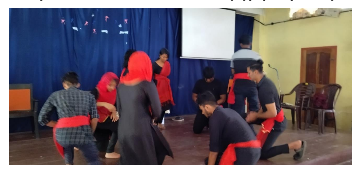
Students performing in the college campus as part of 'Orange the World'

The campaign "Orange the World" was held in association with NCC and Women's Cell. The street play was a powerful performance that highlighted the different forms of domestic violence and the impact it has on victims and their families. The play also conveyed the message that domestic violence is never justifiable and that there are resources available to help victims. The street play and campaign were a success in raising awareness about domestic violence and encouraging people to speak out against it.