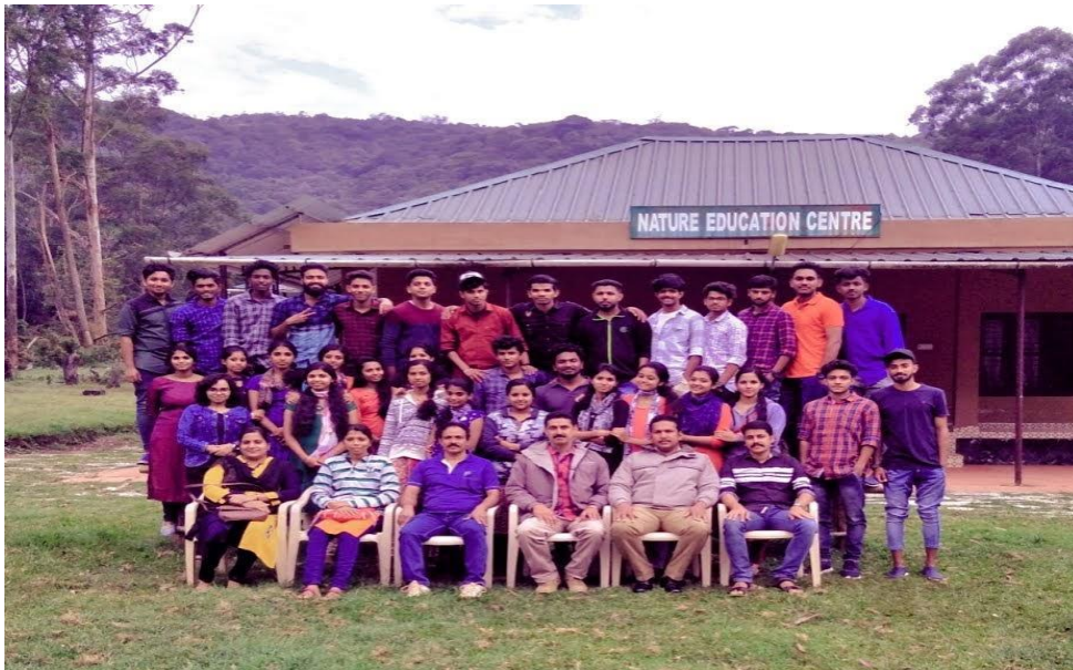
Participants at Nature Education Centre, Pampadum Chola National Park

ARAKULAM P.O- 685591 IDUKKI, KERALA stjosephscollegemoolamattom.ac.in