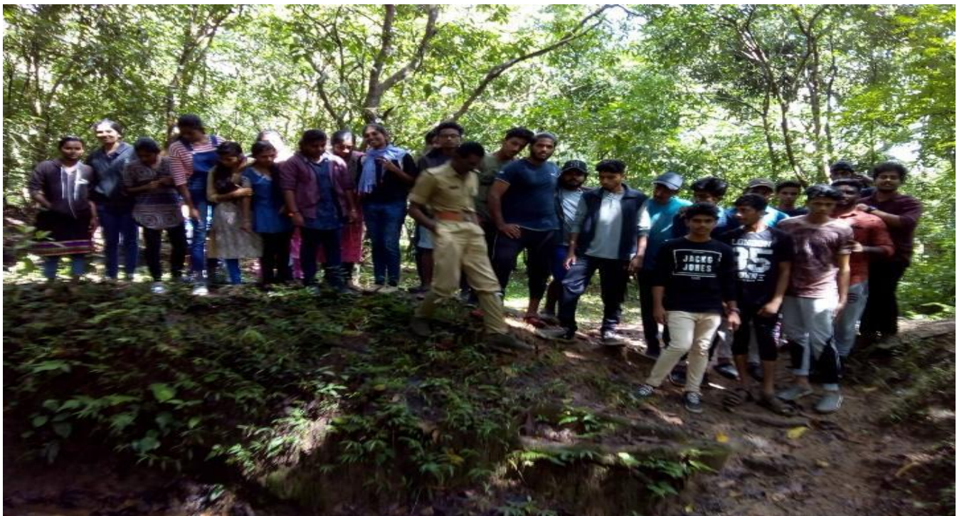
Students at Periyar Tiger Reserve

The initiative aimed to enhance ecological understanding and foster conservation values among participants, promoting a deeper connection with nature and wildlife.