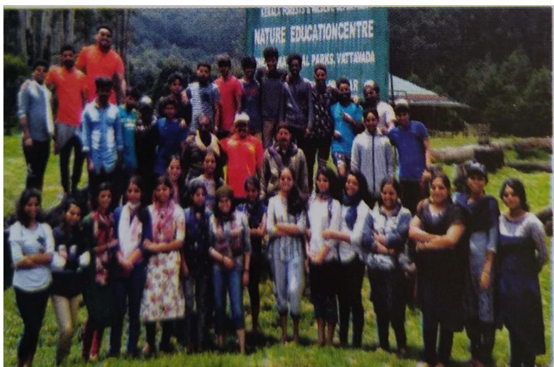
Students at Pampadum Chola National Park

This hands-on engagement kindled a profound connection with the natural world, instilling a sense of responsibility towards its preservation. The camp effectively combined education and adventure, fostering a generation of ecologically conscious and responsible individuals.