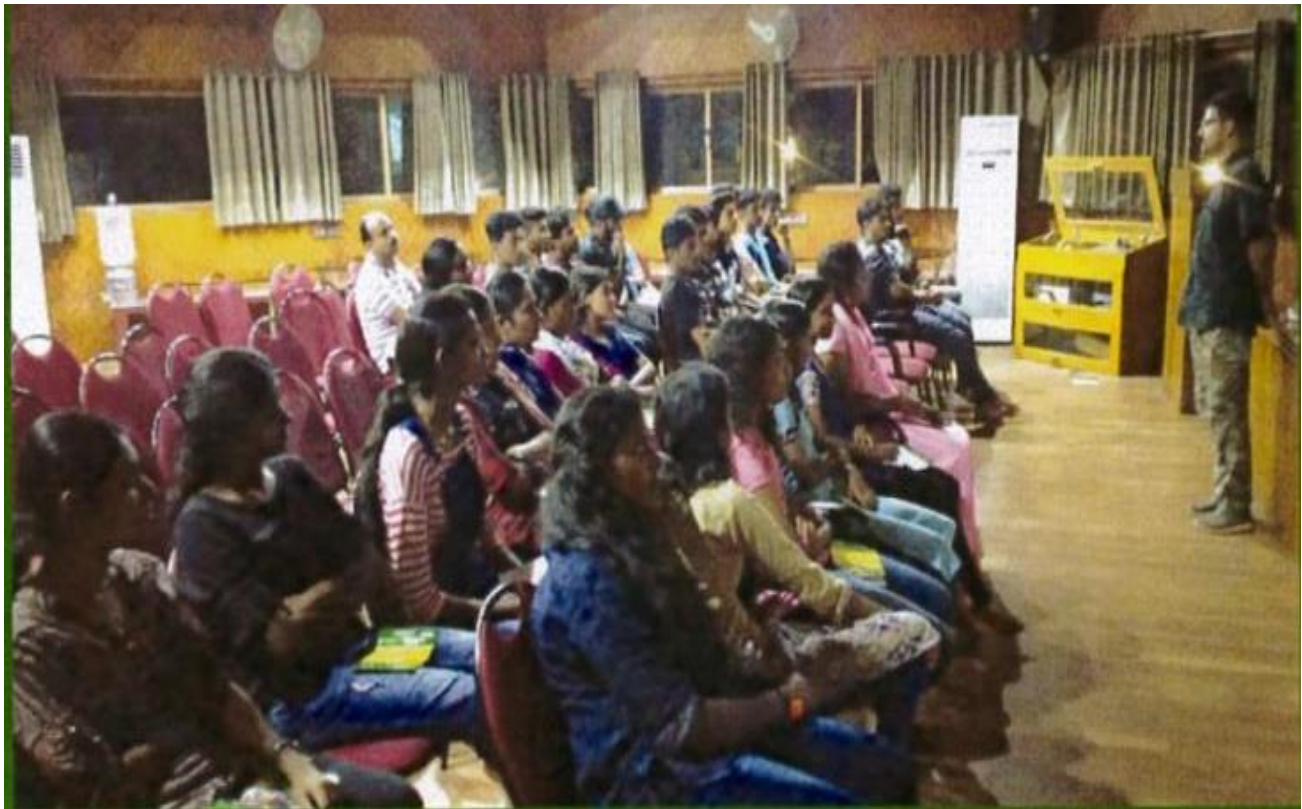
Students attending classes by Forest Department