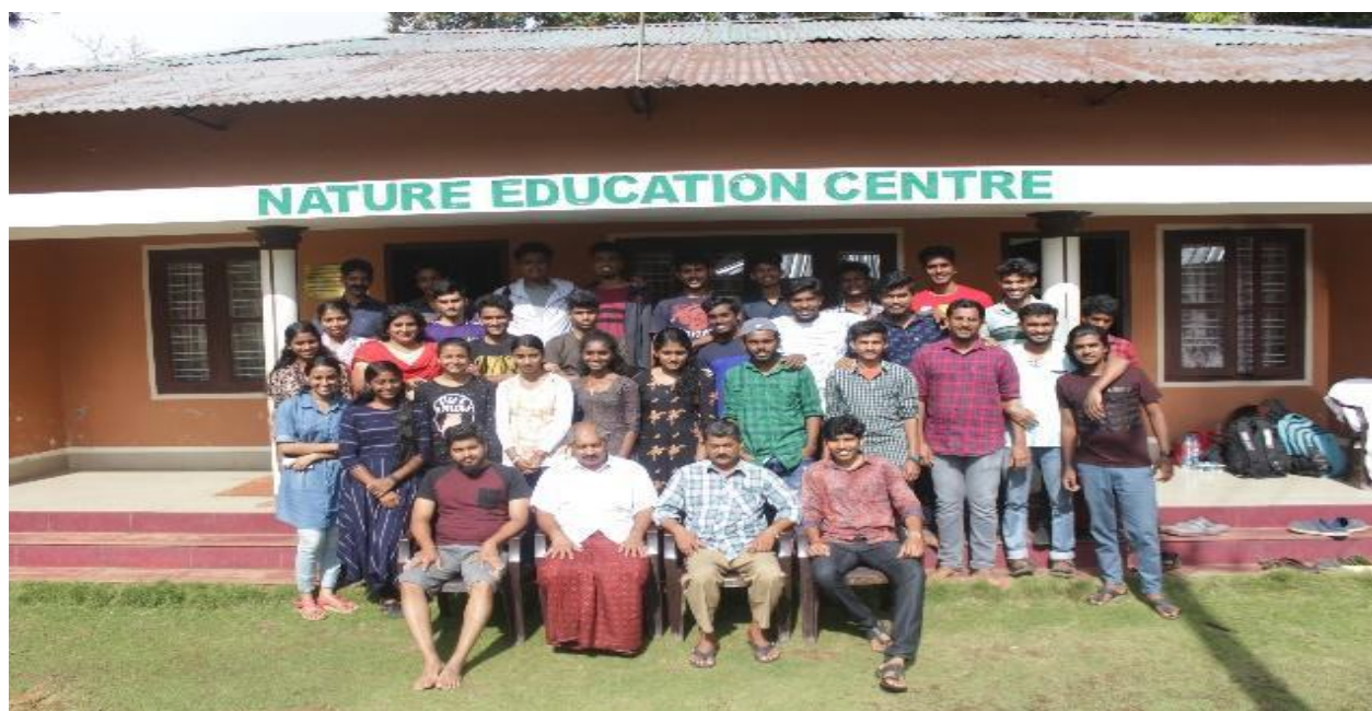
Participants at Mathikettan shola National Park