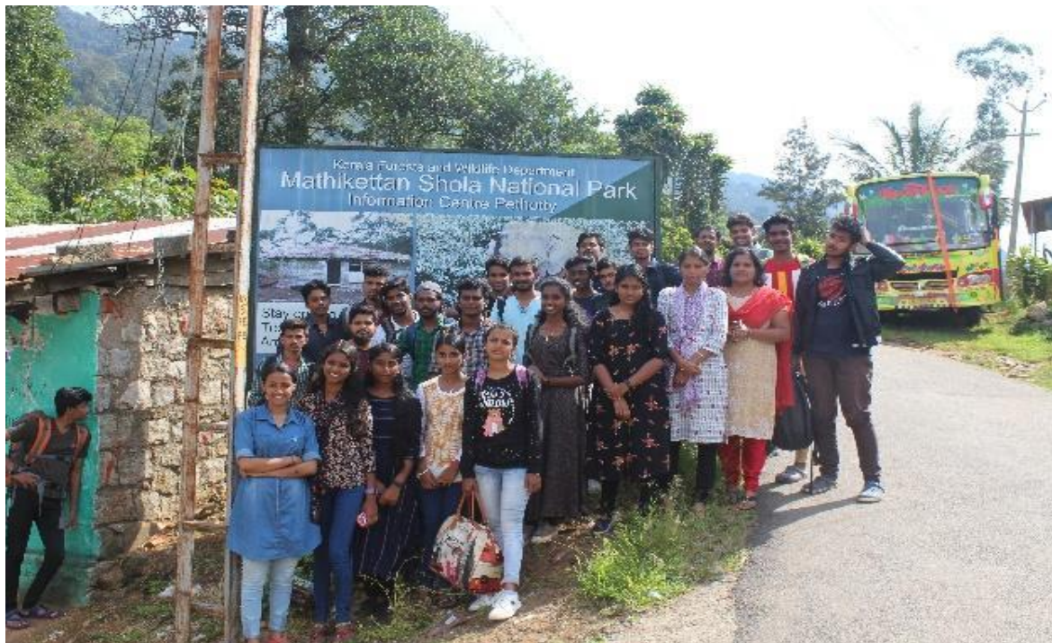
Participants in front of the gate of Mathikettan Chola National park

Expected outcome: This immersive experience proved invaluable, fostering deep appreciation for forest preservation, diverse wildlife, and the ecosystem's importance. The event enhanced students' awareness of environmental conservation and enriched their understanding of various species.