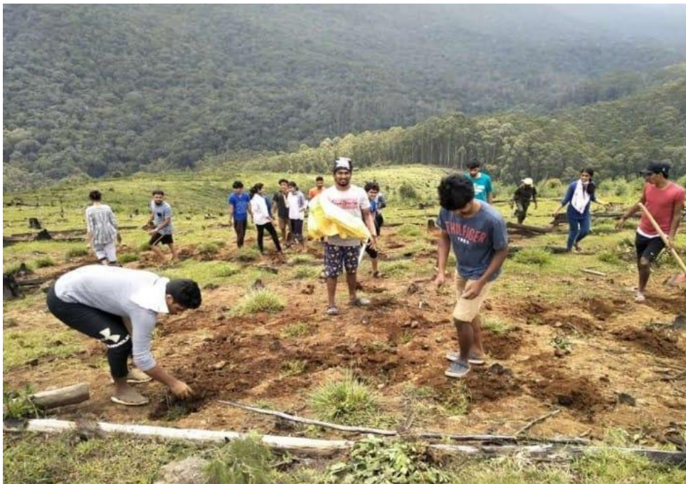
Students planting tree at Kodavari National Park